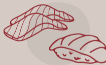
set sushi 6 units 3 sashimi . 3 nigiris